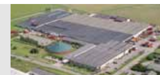
Nørre Alslev, Denmark