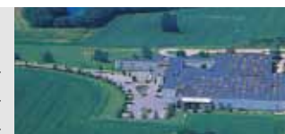
Høje Taastrup, Denmark