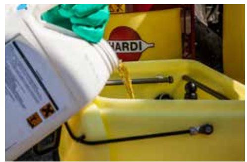
25 I ChemFiller