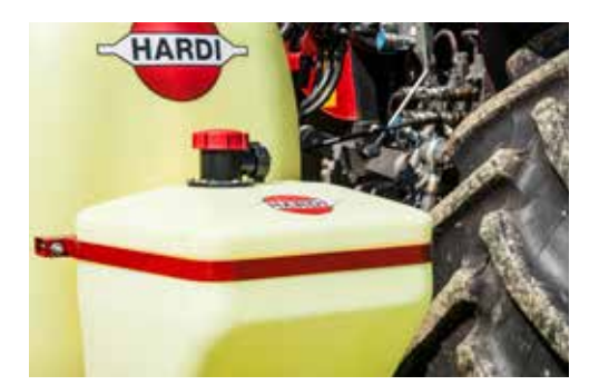
60 l RinseTank