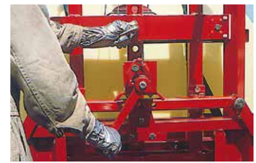
TRIPLET Foot step Remote control Manual boom lift