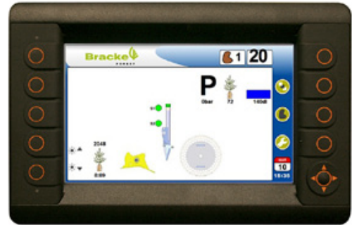
Bracke Growth Control is a PLC-based control system.