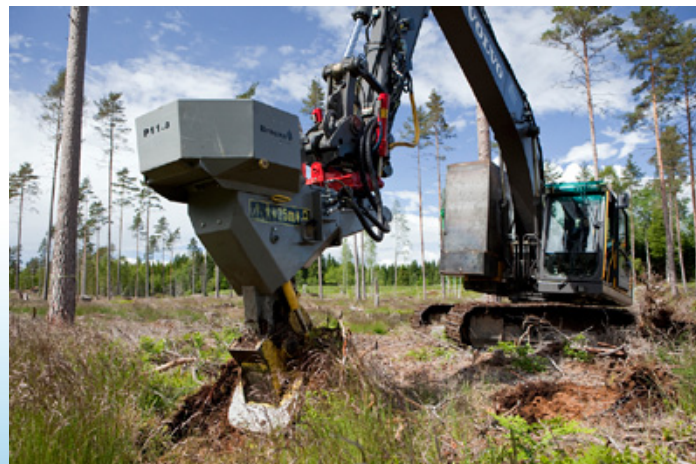
The P11.a both scarifies and plants.