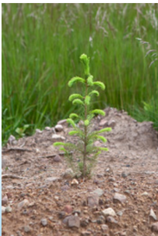
The P11.a provides regeneration of the highest quality and with the greatest possible consideration for biological aspects.