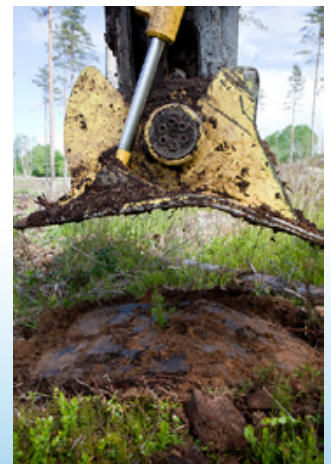
The P11.a plants at the same depth in the center of each mound every time for the best production and survival.