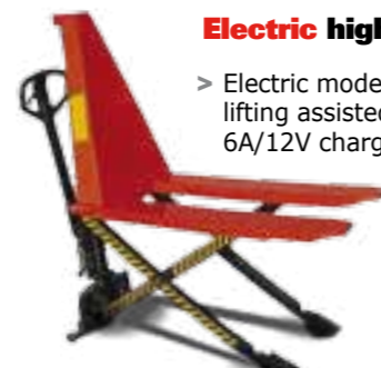
Electric high lift

> Electric model, comfortable to use thanks to lifting assisted by a 70AH/12V battery and a 6A/12V charger.