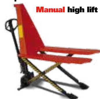
Manual high lift